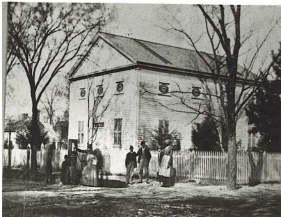
Old St. Paul's in 1863

Fifteen years elapsed and the congregation had grown due to immigration and conversions when Bishop England returned to