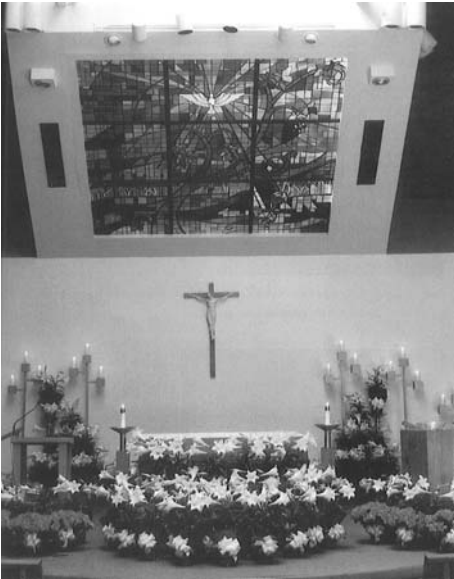
St. Paul's Altar, Easter 1997

meeting on July 9, 1998, brought with them life times of experience and expertise in such fields as HVAC, architecture, structural engineering and construction, demographics, and public relations. New parishioners with special gifts were asked to join the committee as well. Over the years the following