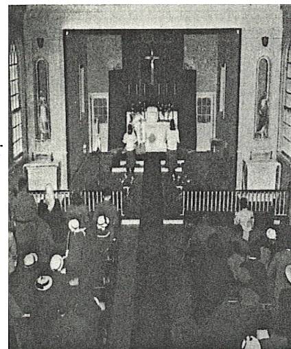
St. Joseph’s Church, 1951

on the other side of the Church building. In 1944 the Sisters of St. Joseph of Newark, NJ bought St. Luke’s Hospital on the corner of Broad St. and George St. built in 1915 by local physicians, to serve as a 40-bed hospital. It was enlarged and renovated in 1946 to accommodate up to 75 beds. It was in use until Craven hospital was built. The building was sold to the county.