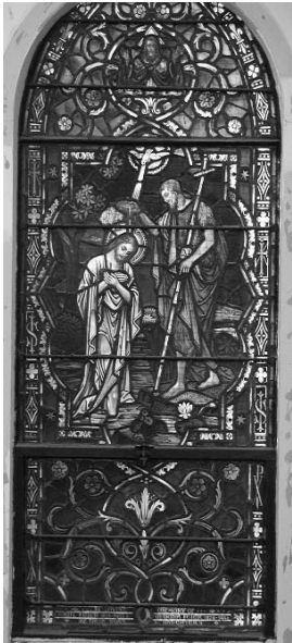
The Baptism of the Lord