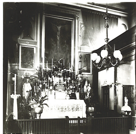
Altar , Old St. Paul's, about 1890