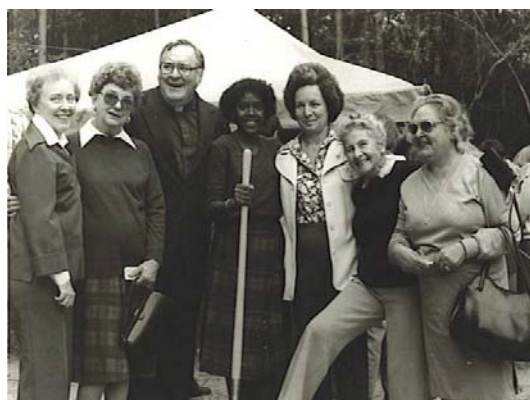
Groundbreaking for the first Church on Country Club Road, 1981

With the influx of retirees from the North and many young professionals with families moving to New Bern, the Catholic population continued to grow. Sta-